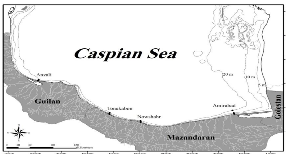
Figure 1: Map of the sampling stations in the Iranian coasts of Caspian Sea.

This study was carried out in the framework of a multidisciplinary research project during 2013 and 2014. The water samples (three replicates) were collected seasonally (May13, August13, November13 and February14) using Niskin bottle (1.7 L) along four transects (Anzali, Tonekabon, Nowshahr and Amirabad) in the ICWCS. Along each transect, samples were collected at 3, 5, 10 and 20 m depths from the surface, 5, 10 and 20 m layers (Fig. 1). The samples were kept in 1L polyethylene bottles and placed on ice. In the laboratory the samples were kept frozen in the dark (-20 °C) until they were analyzed. Besides this, sample collections were performed in all four seasons because of the significant difference of environmental and biological parameters between seasons in the ICWCS (Nasrollahzadeh, 2008).